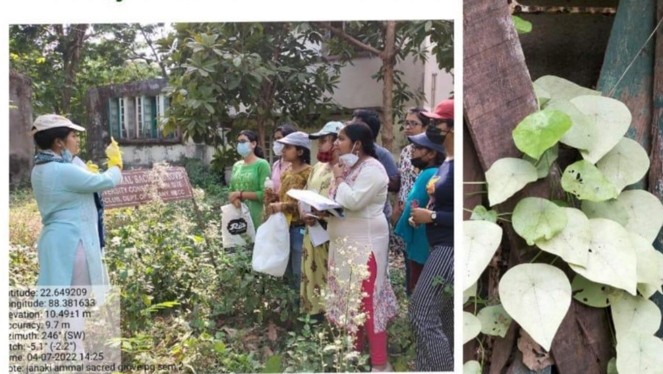
Green Audit: an ecological and taxonomic study of Janaki Ammal Sacred Grove.