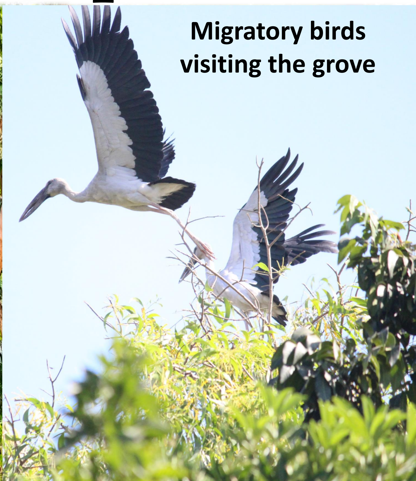
Migratory birds visiting the grove