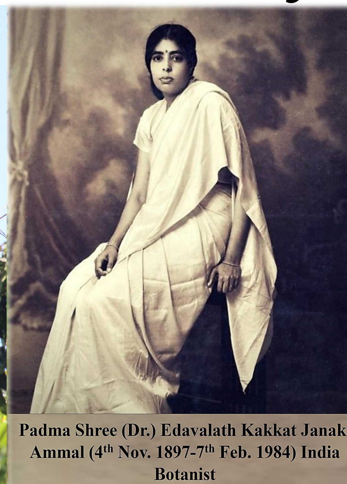
Padma Shree (Dr.) Edavalath Kakkat Janaki Ammal (4 th Nov. 1897-7 th Feb. 1984) India Botanist